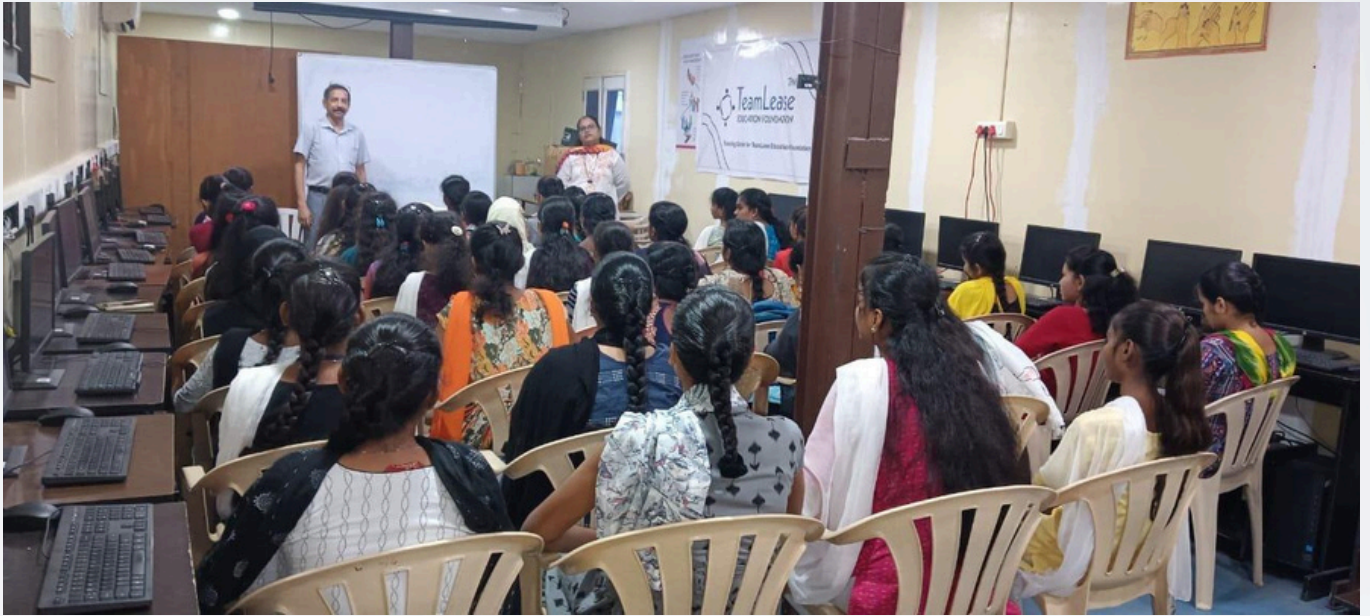
PHOTO GALLERY - SKILL DEVELOPMENT