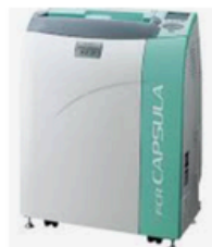
Computed Radiography (CR) System