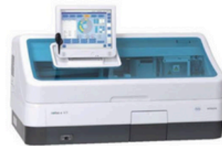
Cobas e411 analyser(Disk system)