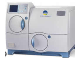
Automatic bacterial identificatory (VITEK 2 Compact 30 Biome Rieux)