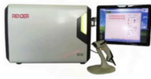
Automated Blood and Body fluid culture System