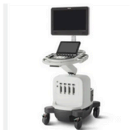
Ultrasound Affinity 70 (Affinity 70 Philips)